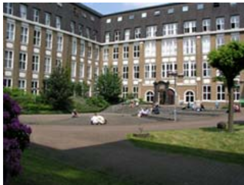
FACH HOCH SCHULE

I finished elementary and middle school and at the age of 16, I entered a three-year program at the Technical School of Industry in Tehran. I was 19 when I obtained my advanced technical diploma. With my father’s encouragement, I went to Germany in the late seventies to enhance my technical knowledge and to specialize in industrial practices.