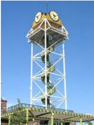
Tower Clocks at Various Locations in Iran

I returned to Iran In 1980, and together with my father, we started manufacturing our “Tower Clocks”. These revolutionary clocks were the first of their kind in the Middle East.